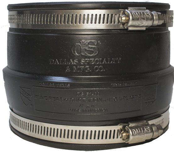
Part pictured may not be actual coupling, picture for reference only / Part may or may not be assembled with flexible PVC bushings to accommodate size reduction

Dallas Specialty DS51 Series Couplings fit a variety of piping sizes, one end accommodates Ductile Iron or A/C Fibre Piping Systems and opposite end for CI/PVC will also accommodate SDR35, Plastic, Service Weight, No-Hub, Stainless Steel, XHCl, ABS and other piping systems with similar pipe od's