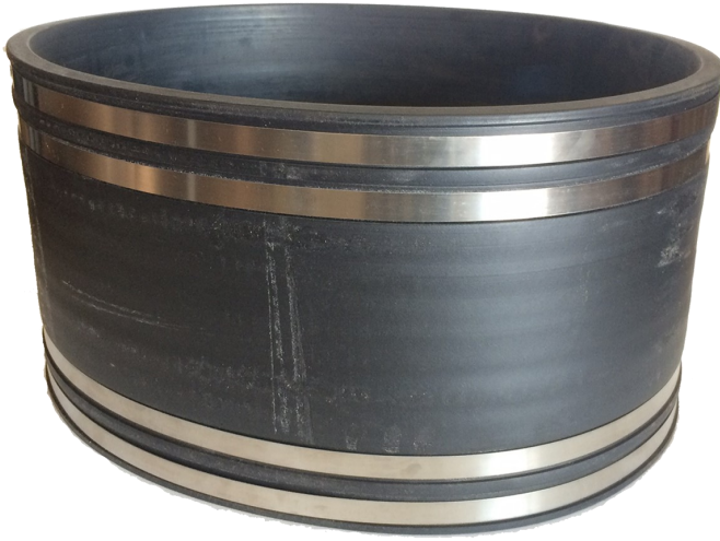
Part shown may not be actual part, for ref. only