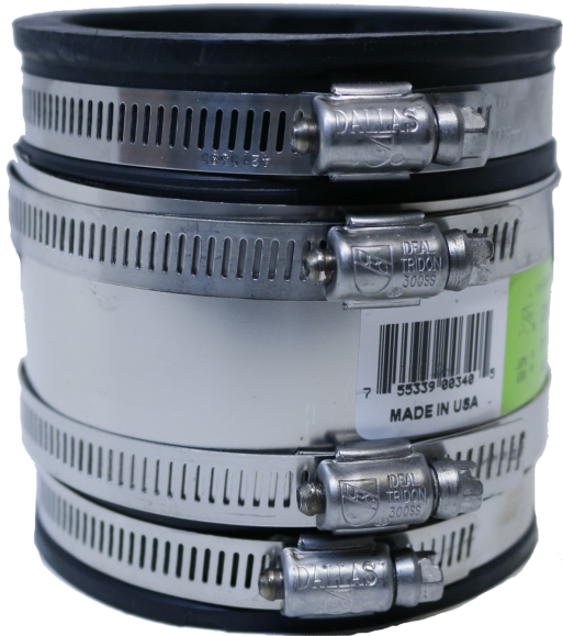
Part shown may not be actual part, for reference only

Accommodates Pipe Size Range OD's 2.28"-2.50" x 1.58"-1.68"(3-5%+/-OD's)