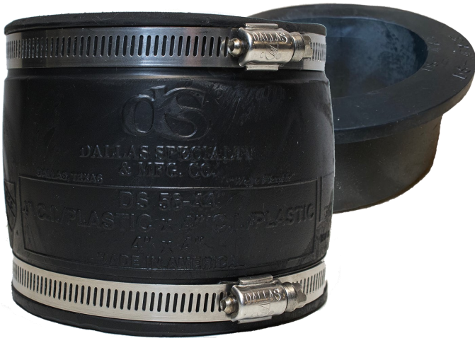
Part shown may not be actual part, for reference only

Designed to fit 4" Stainless Steel Tube x 4" CI/PVC Pipe Coupling accommodates Pipe Range OD's of 3.88-4.10" x 4.20-4.60"